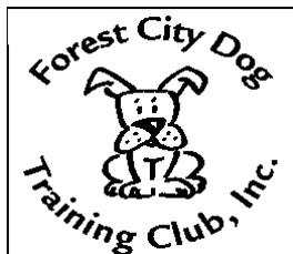
(Licensed by the American Kennel Club)

Friday, March 8, 2013 – Event # 2013024501 Saturday, March 9, 2013 – Event # 2013024502 Sunday, March 10, 2013 – Event # 2013024503